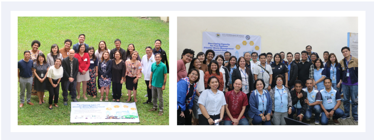
FIGURE 3. Training of Trainers in Ateneo de Manila University (left) and training in Makati City (right).

project team sought the help of an external expert from JSMCWM. The main objective of the training was to equip participants with the knowledge and skills to create a typhoon-specific disaster waste management contingency plan. In total, six training activities were conducted under the project. The trainees were chosen by the two cities.