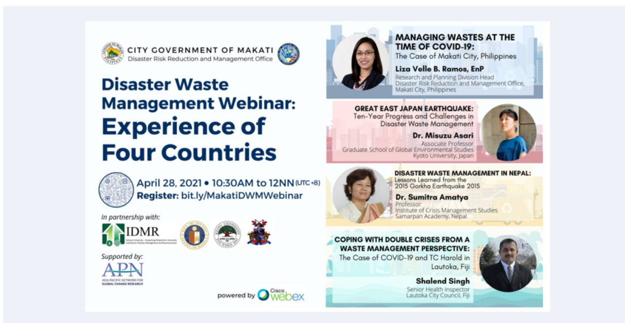
FIGURE 4. Poster for the international webinar organised by the project team.

Oceania (Fiji). The team consisted of researchers from four reputable universities, namely Sichuan University, Kyoto University, Tongji University, and Ateneo de Manila University, who contributed their technical expertise in the capacity development project. Sichuan University runs the Institute for Disaster Management and Reconstruction (IDMR), with disaster waste management as one of its major areas of interest. The university also boasts a competitive Public Health programme, which provided valuable insights into the management of medical and healthcare waste. Tongji University and UNEP-IETC co-manage the UNEP-Tongji Institute of Environment for Sustainable Development (IESD), a think tank that conducts research on various topics, including climate change, disasters and conflicts, environmental governance, harmful substances, resource efficiency, environmental assessments, and technology transfer facilitation to developing countries. UNEP-IETC serves as the global centre of excellence for environmentally sound technologies, with a specific focus on waste management. Ateneo de Manila University's Department of Environmental Science aims to prepare the next generation of environmental scientists to apply classroom concepts to real-world issues, making it a valuable partner in the capacity building project. The