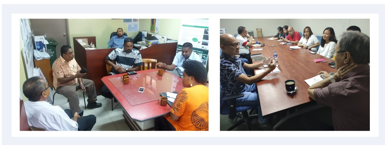
FIGURE 2. Focus group discussions in Lautoka City (left) and Makati City (right) for the training needs assessment.

The events concluded with a discussion among the attendees on ways to achieve the project objectives.